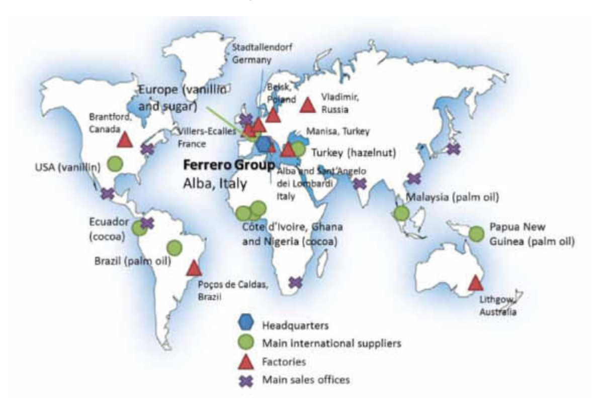
Figure 1. Nutella GVC

Source: Nutella and De Backer and Mirodout (2013)